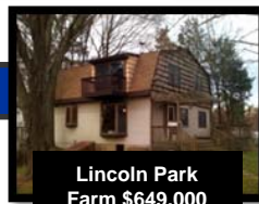
Lincoln Park Farm $649,000