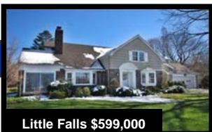
Little Falls $599,000