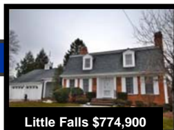
Little Falls $774,900