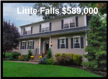
Little Falls $589,000

39 E. Main Street Little Falls 973-256-0303